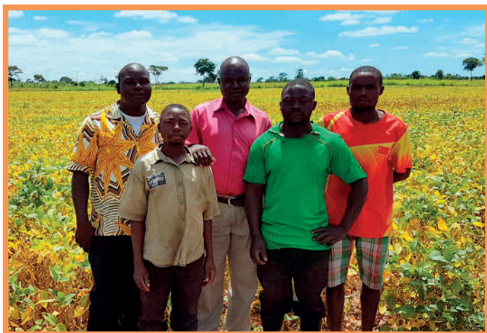
Farmers in their soya field

Because farming in the area is entirely dependent on rainfall, we are experimenting with ways to harvest rainwater and use solar power pumps for irrigation. There are several technical challenges to overcome, but with some inspired thinking we hope shortly to have a system to trial.