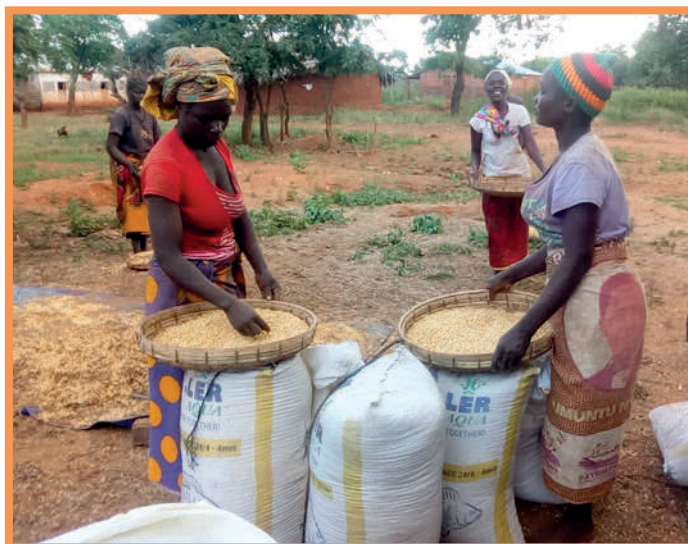
Women sorting soya beans

The soya crop has just been harvested with yields exceeding our forecast. The seed is now being sorted and bagged.